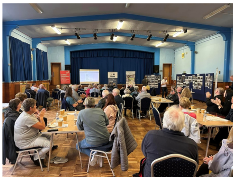
The well attended meeting in Dalmellington