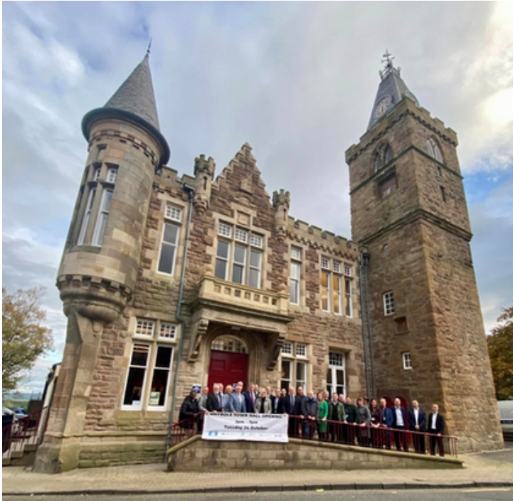
The splendid exterior of Maybole Town Hall

I was delighted to be invited to attend the reopening of the newly refurbished Maybole Town Hall. This project has transformed the Town Hall inside and out and is the culmination of the hard work of many different organisations. The project was realised thanks to funding of £1.2 million, including nearly £580,000 from the Scottish Government. Other key funders include South Ayrshire Council, Historic Environment Scotland and Heritage Lottery. I was particularly pleased to see that the original Tolbooth bell, cast in Maybole in 1696, is in pride of place in the refurbished council chamber.