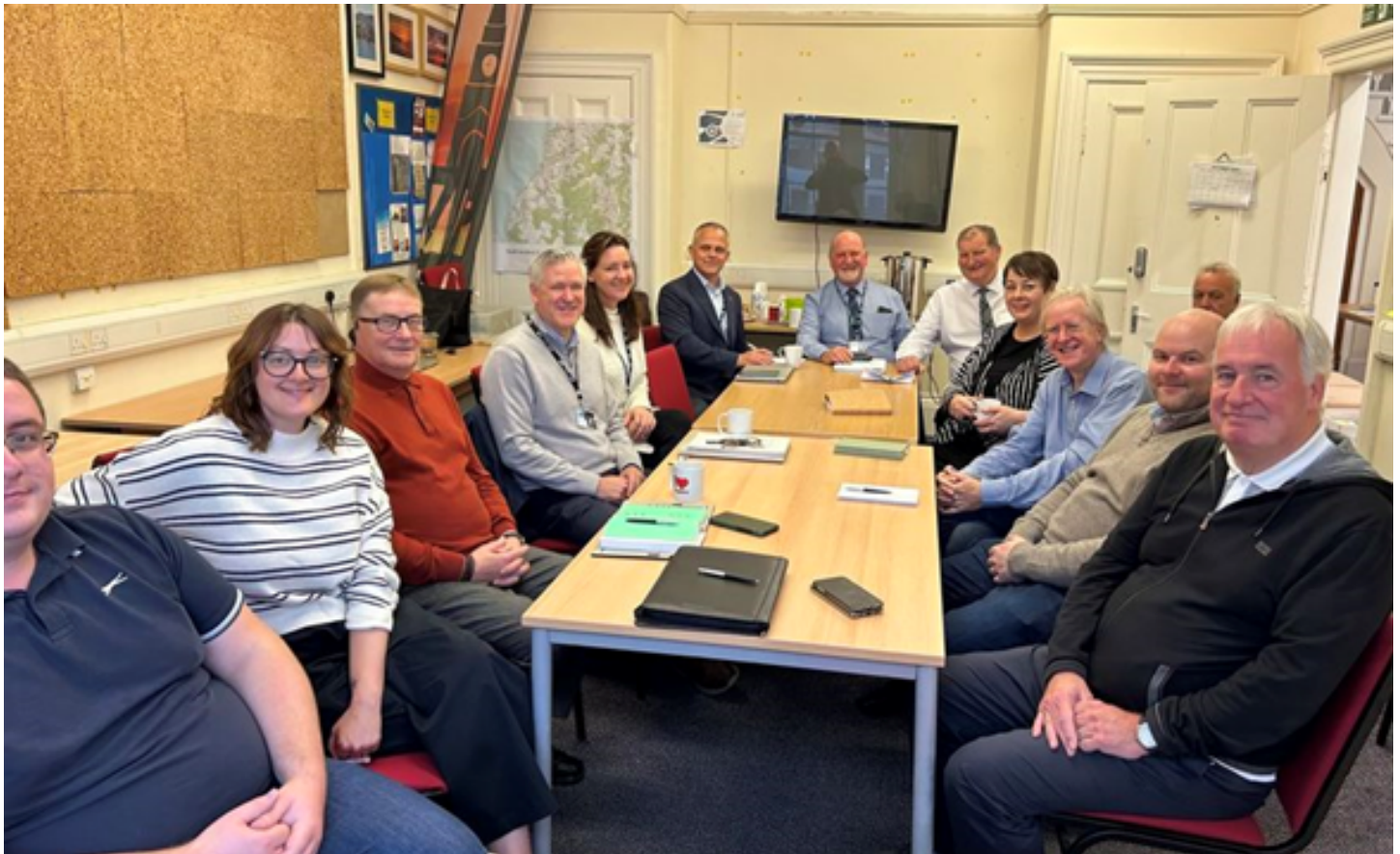
Some of the many dedicated participants involved in Girvan Town Centre Regeneration

The commitment and enthusiasm of all involved in regenerating Girvan is truly outstanding.