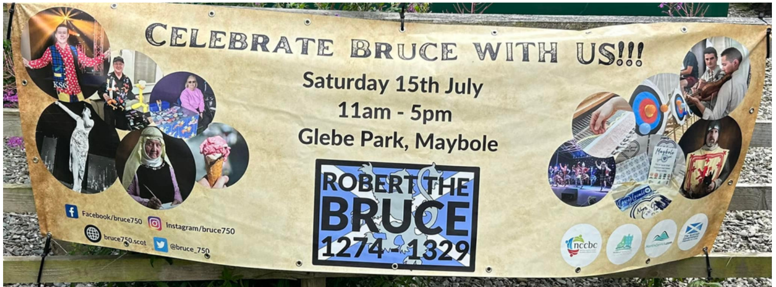
Pictured above: the banner for the Robert the Bruce Heritage Day in Maybole.