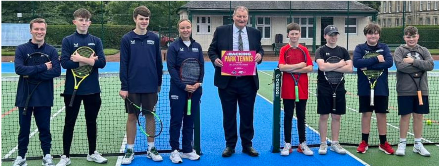
Pictured above at the refurbished Ayr Fort Tennis Courts.